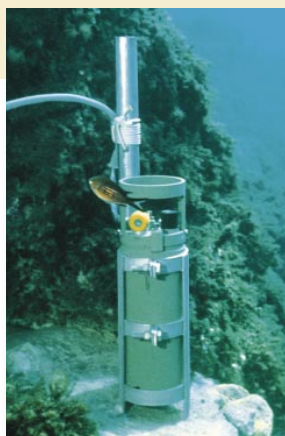
▲ Many tide gauges have been deployed around the Mediterranean Basin to take regular and accurate measurements near the coastline. Satellites are a vital complement to these tide gauges.